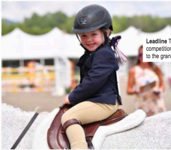
Leadline The Vermont Summer Festival offers competition for riders of all ages from leadline to the grand prix.