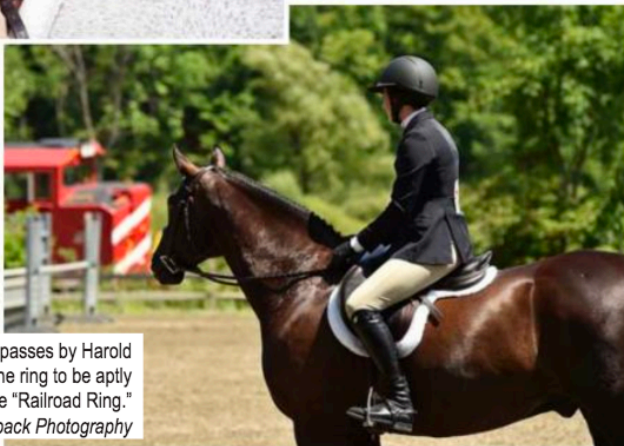
Train The iconic train that passes by Harold Beebe Farm inspired one ring to be aptly named the "Railroad Ring."